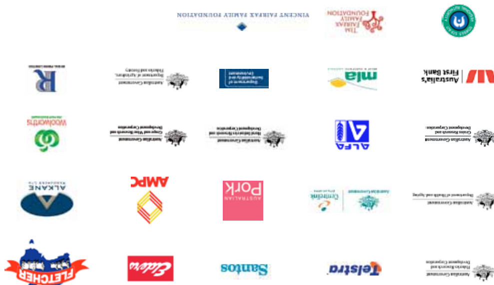
INVESTORS IN RURAL AUSTRALIA THROUGH COURSE 18:

1st Floor 24 Napier Close Deakin ACT 2600 PO Box 298 Deakin West ACT 2600 T. 02 6281 0680 F. 02 6285 4676 info@rural-leaders.com.au www.rural-leaders.com.au ABN 80 056 874 787