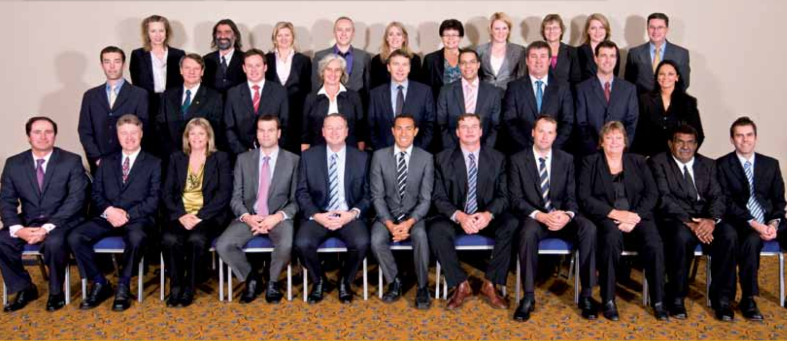
THESE MEN AND WOMEN ARE COMMITTED TO SHAPING THE FUTURE OF RURAL, REMOTE, AND REGIONAL AUSTRALIA